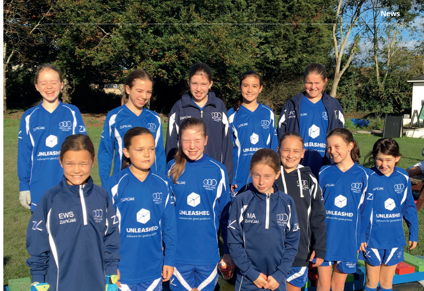
U12s away to Portishead on a sunny day!

Check out our Facebook page https://www.facebook.com/groups/237169567430828/