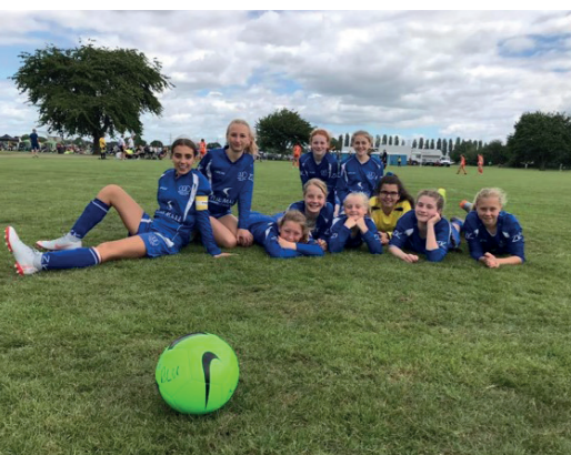
Aces squad /pirates!!!