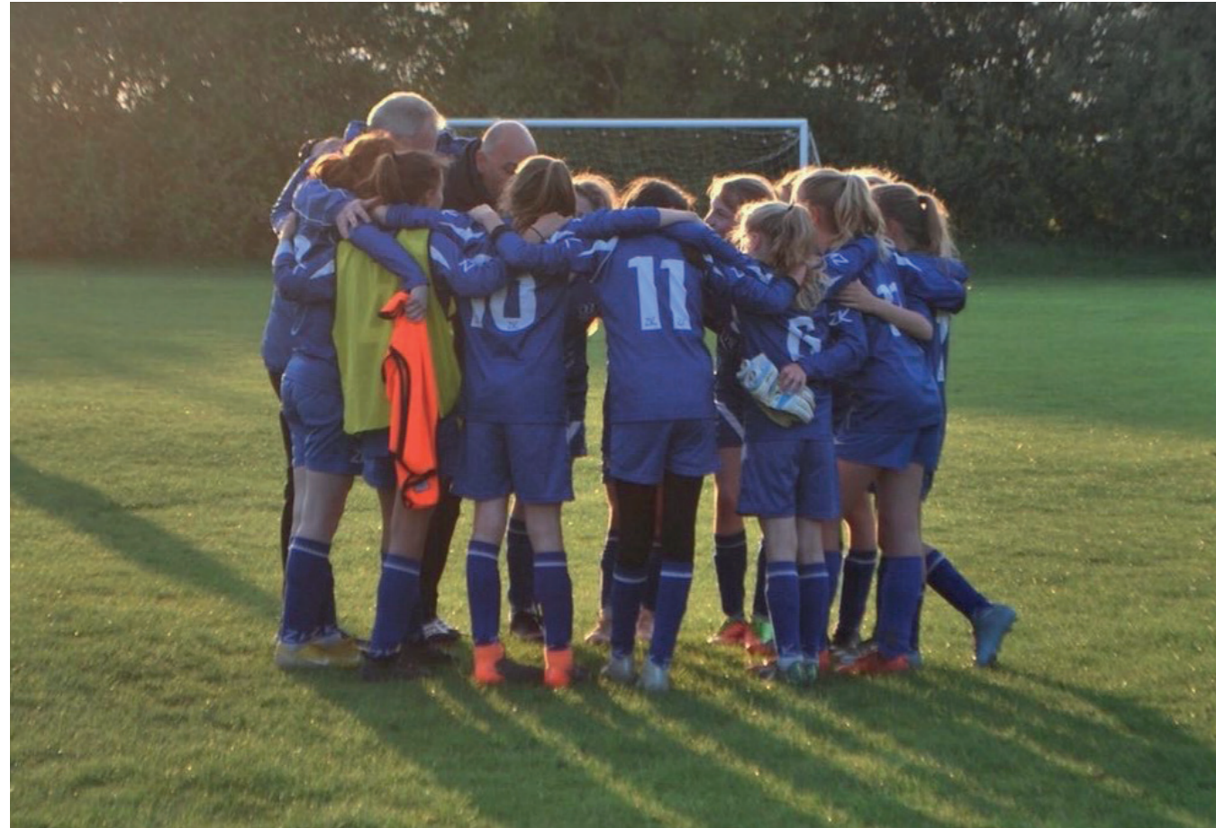
The night we got over the line .....